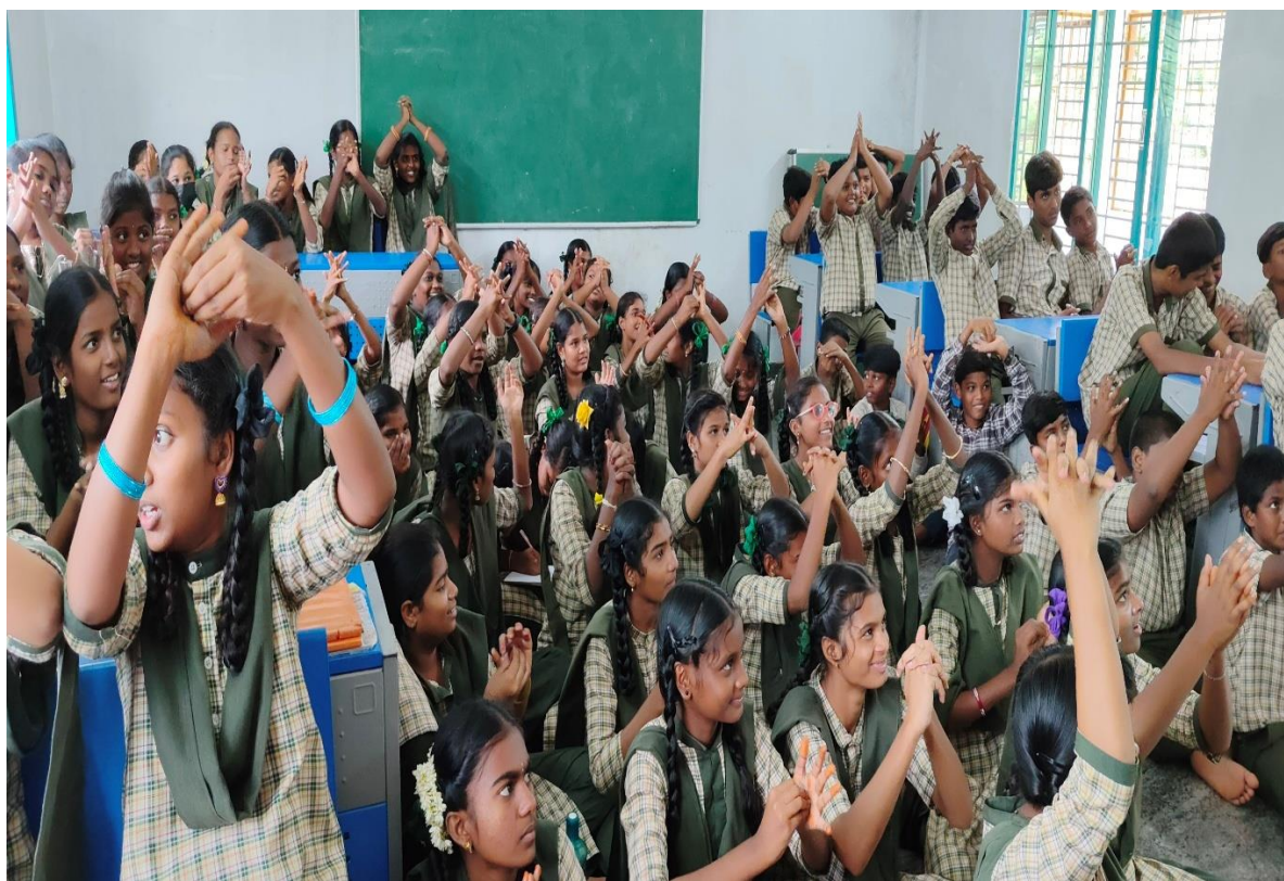
Students practicing the steps in Hand wash protocol

The Headmistress Smt. Bharathi, along with teachers Smt. Nirmala and Sri Gopinath, appreciated the efforts of the NSS units and encouraged students to practice the habit daily. The students actively participated in the demonstration and pledged to spread the message of